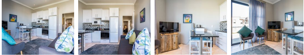
Web Ref RLS964349