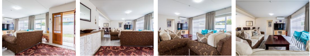
Web Ref RLS974318