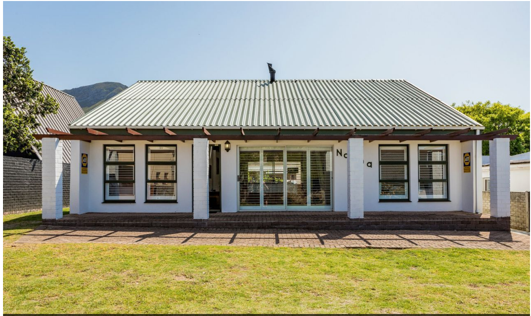
SOLE MANDATE Web Ref RLS969324