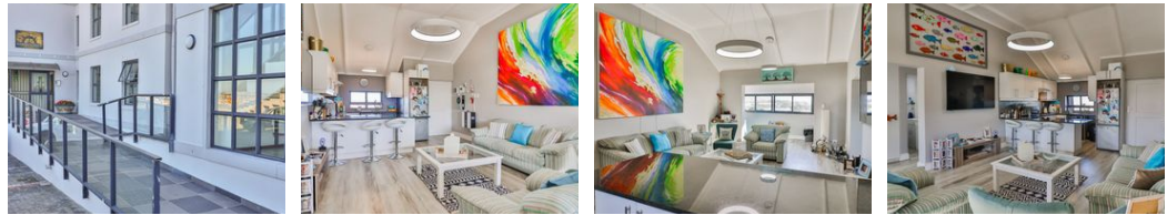
Web Ref RLS978689