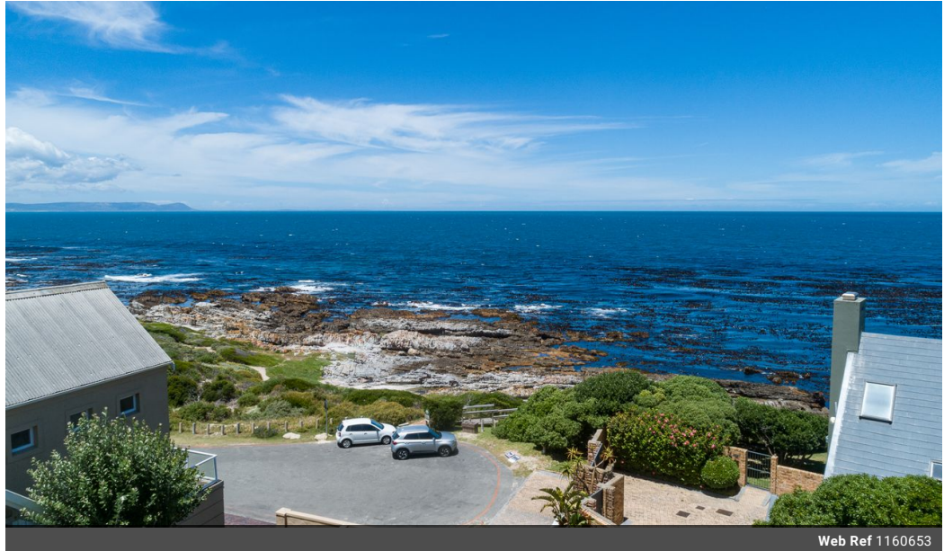
Web Ref 1160653