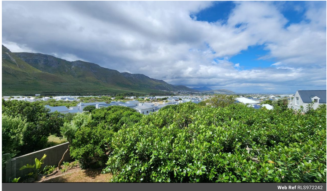
Web Ref RLS972242