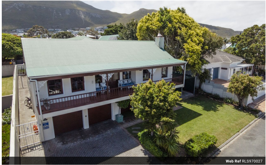
Web Ref RLS970027