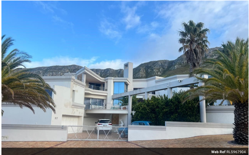
Web Ref RLS967904