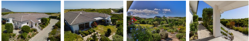
Web Ref RLS976539