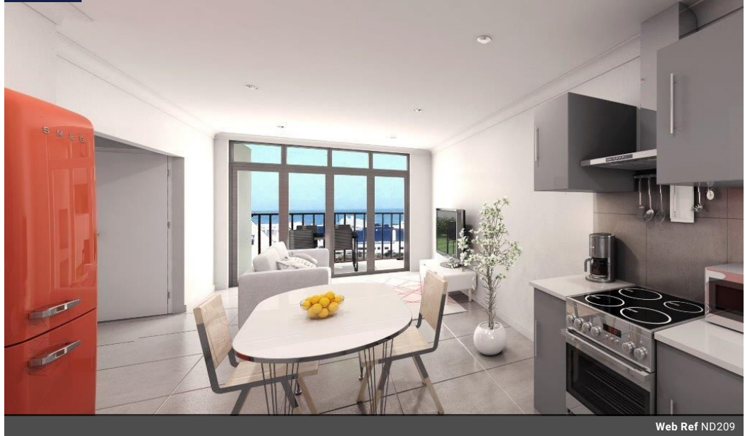
Web Ref ND209