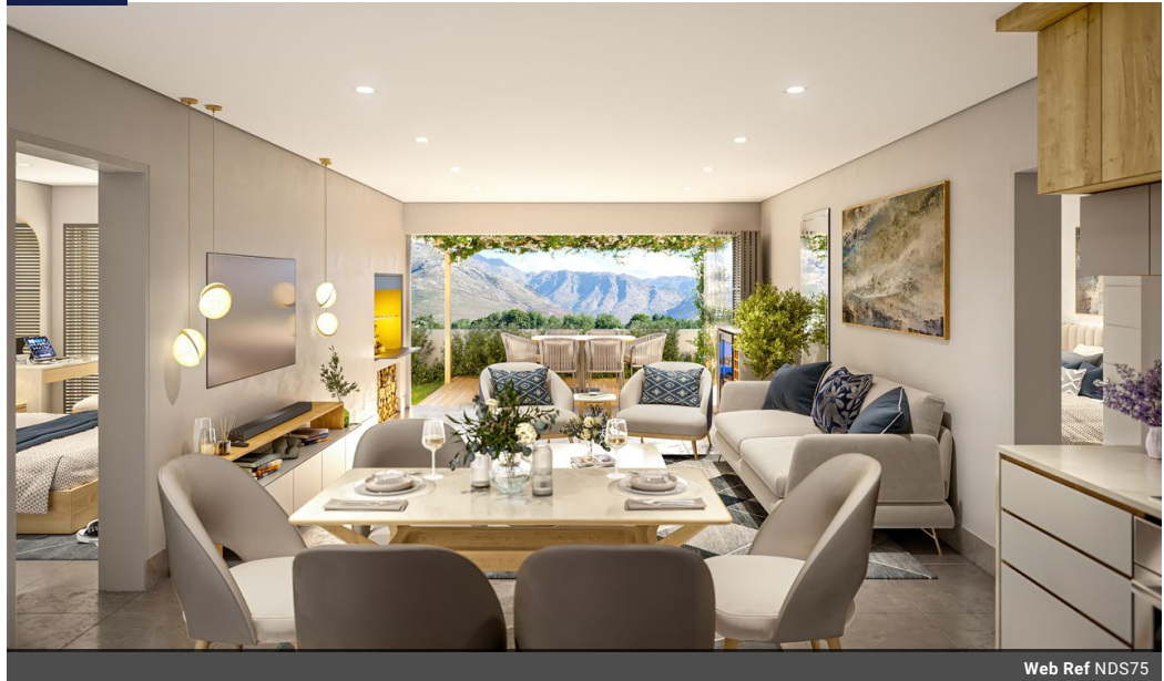
Web Ref NDS75