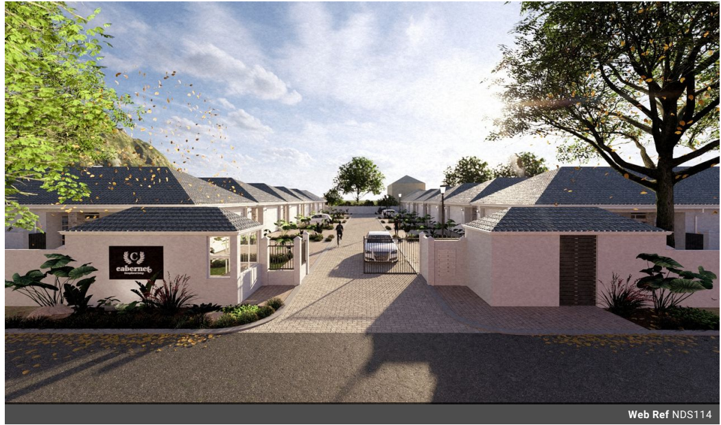
Web Ref NDS114