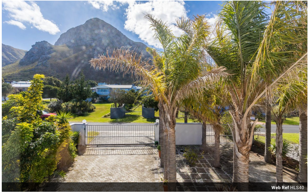
Web Ref HLS40