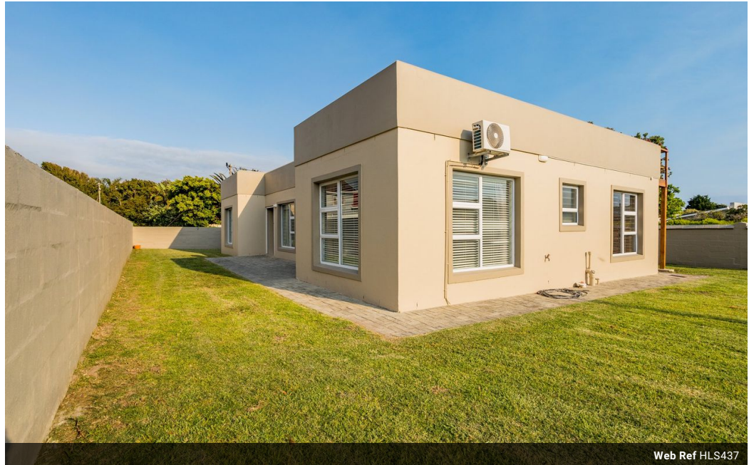
Web Ref HLS437