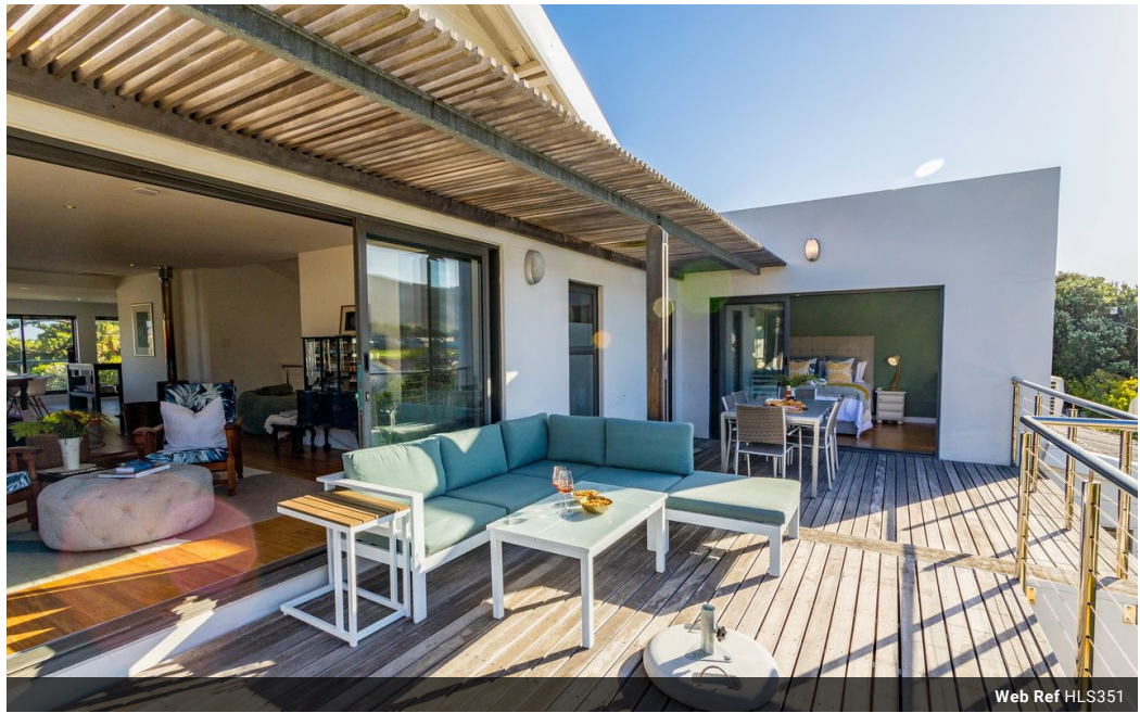
Web Ref HLS351